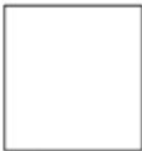
Hull White (RAL 9016)