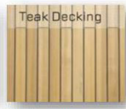
Cockpit seating & Bathing Platform