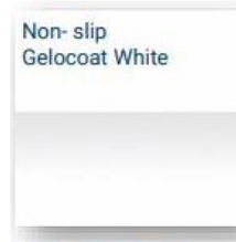
On Side decks & Cockpit Floor