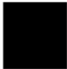
Stripe Jet Black (Pantone 426)